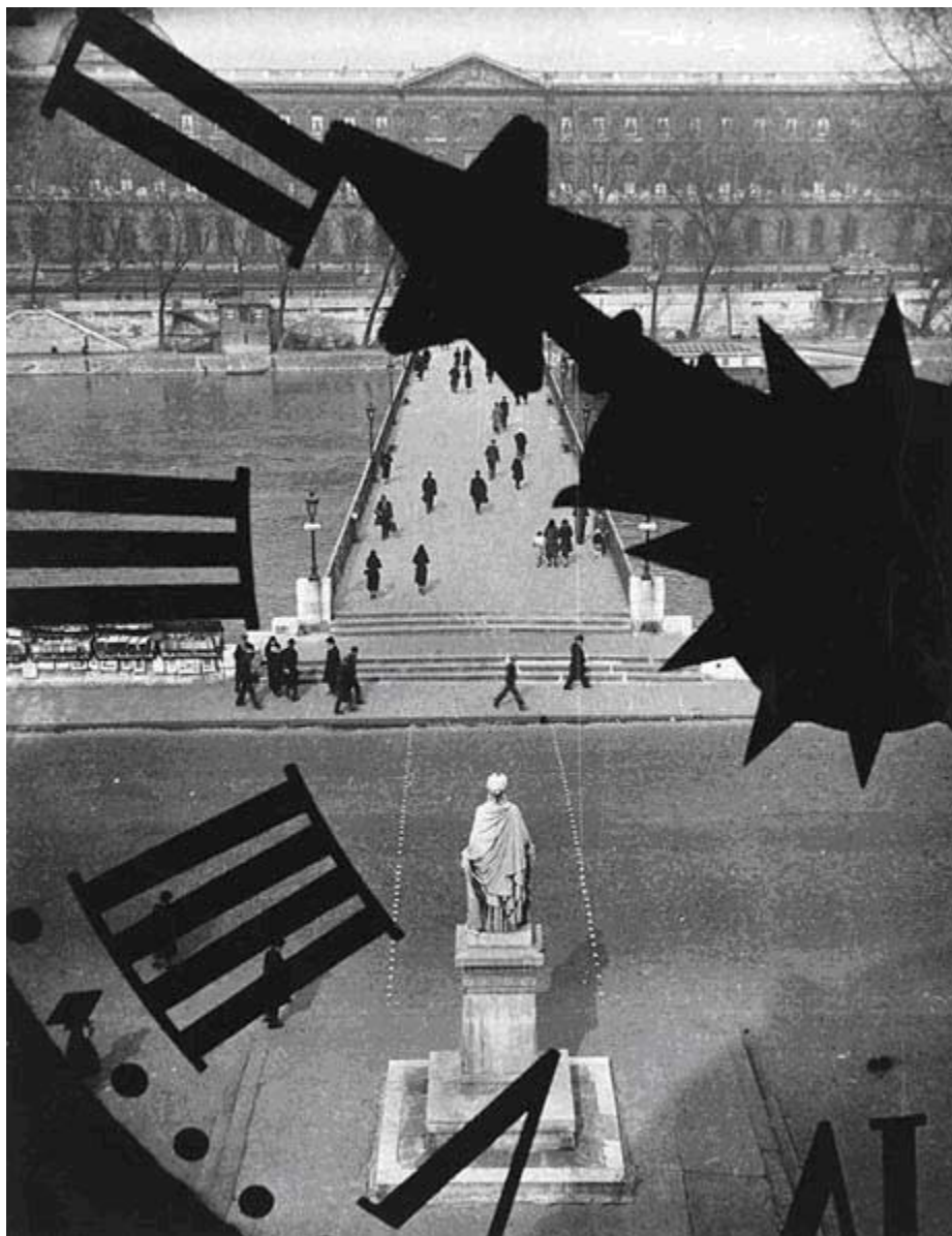
André Kertész, Clock of the Académie Française, Paris , © Estate of André Kertész. Courtesy The J. Paul Getty Museum, Los Angeles.

One of the most original photographers of the 20 th century, André Kertész often created unexpected compositions from everyday subjects. The J. Paul Getty Museum , Los Angeles, presents André Kertész Photographs: Seven Decades , an exhibition that shows the